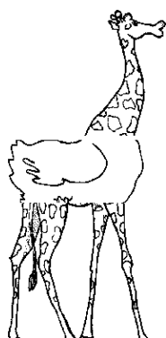
GIR - U - FFE

Do this several times and write a report in your journal.